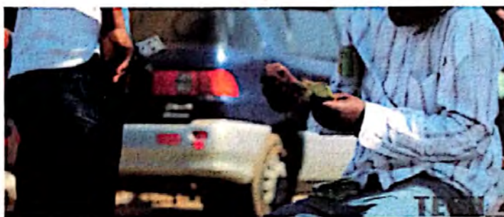
Adapted from online images