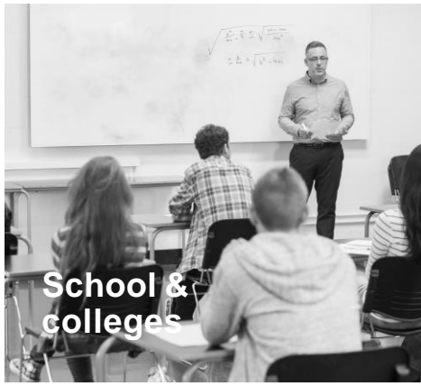
School & colleges