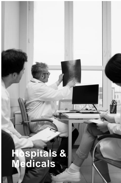
Hospitals & Medicals