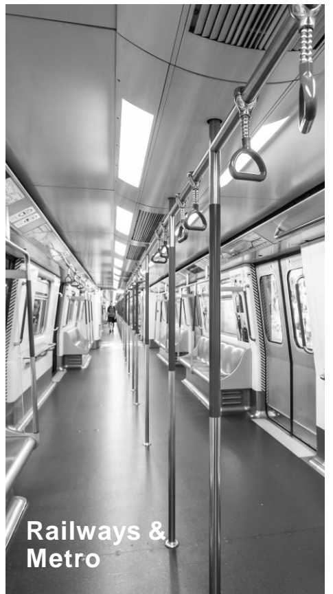
Railways & Metro