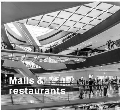
Malls & restaurants