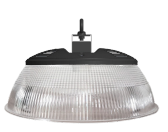
UHXE-PCR-B-90D UHXE-165-220W 90-DEGREE PC REFLECTOR