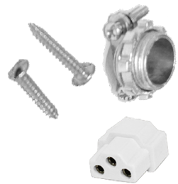
Included Accessories: End-to-End Coupling Mounting Screws