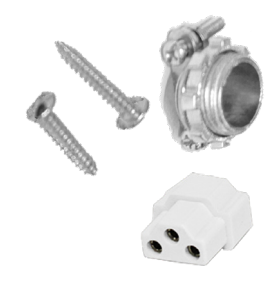
Included Accessories: End-to-End Coupling Mounting Screws