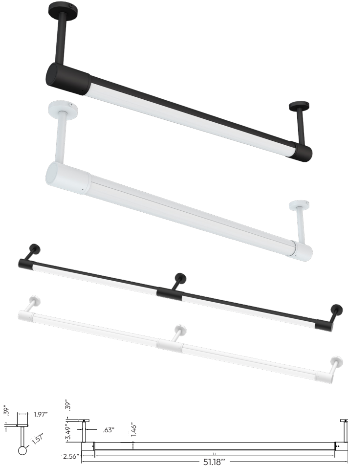
Technical Drawing: 1.97" (D) x 51.18" (W) x 5.79" (H)