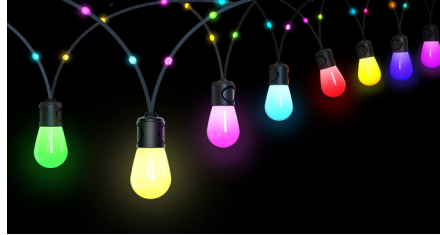
Light On View