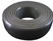
SCL-100FT-SJTW18/6-BK BLACK 100 FT. CORD, SJTW 18 AWG 6-CONDUCT ( WH/BK/GN/PU/GY + RED FOR EMERGENCY)