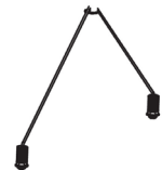
SCL-YCK ADJ. 1/16in Y CONVERSION SUSPENSION CABLE WITH TOGGLE ENDS