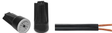
Silicon-filled Wire Nuts 3ft. SPT-2 18AWG Lead Wire