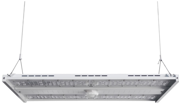
Shown with Optional sensor (Not Included)