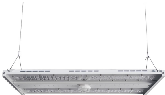
Shown with Optional sensor (Not Included)