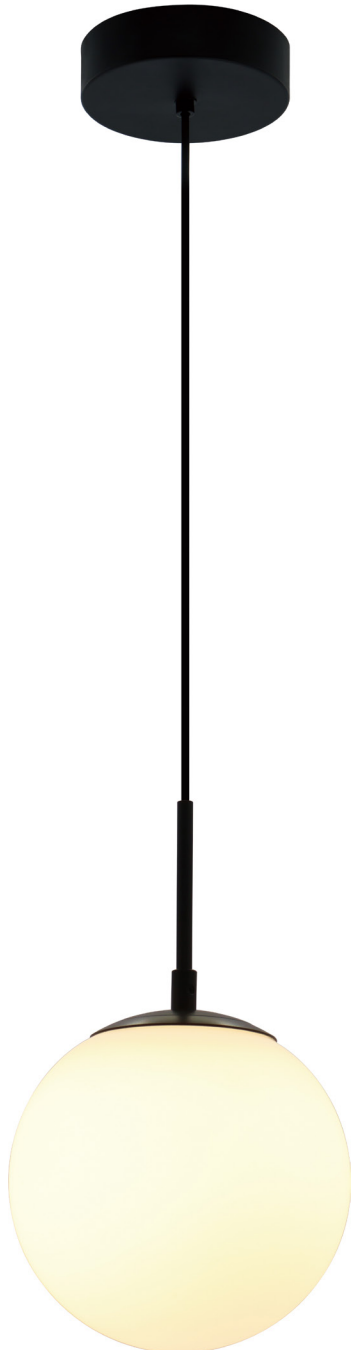
LCFG-8-E26-FR-BK (Lamps Not incl.)