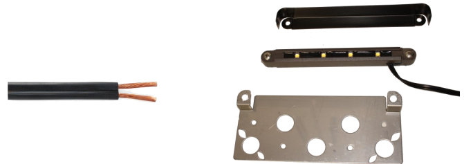
3FT. SPT-2 18AWG Lead Wire