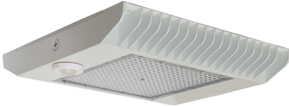
Shown with optional sensor (Not included)