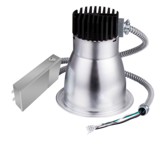
CRLX6-18-40W-MCTP Complete Unit