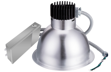
CRLX10-18-40W-MCTP Complete Unit