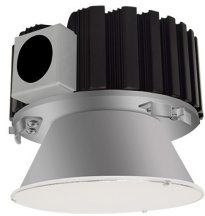
CRLX-EGN-18-40W-MCTP Light Engine