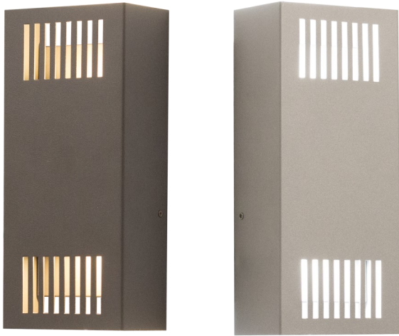
CRES-52-30K-BR CRES-52-40K-BR CRES-52-50K-BR