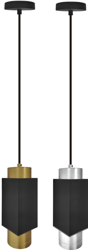
Gold/Black Brush Nickel/Black