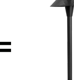
AA-23L-BK + AA-STEM-22-MCT-BK