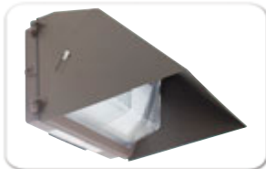
Shown with Optional Shroud See Page A27