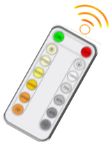
MCTP-RC1 Not Included