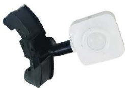
UHB2-SK (Optional Sensor Kit) Includes J-box & sensor