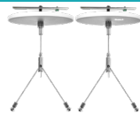
Adjustable 6 Ft. Suspension Kit Select a Y-Connector Key Hole Set (Not Included) See Page B34