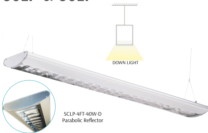
SCLP-4FT-40W-D Parabolic Reflector