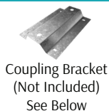
Coupling Bracket (Not Included) See Below