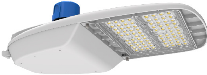
Shown with photocell (Not Included)