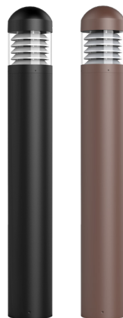
BOL-44-R-L-C-MCTP Bollard 44In Round Dome Top Louver Reflector Clear Lens