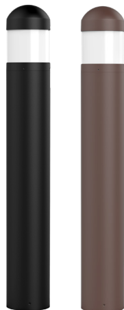
BOL-44-R-C-F-MCTP Bollard 44In Round Dome Top Cone Reflector Frosted Lens