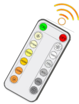
MCTP-RC1 Not Included