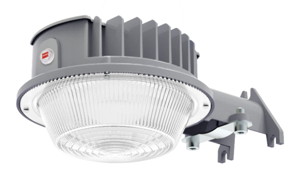
LRX-36-60W-MCTP-P With Botton photocell