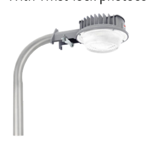
90° EMT Arm and Wall Bracket (Mounting Strap) included