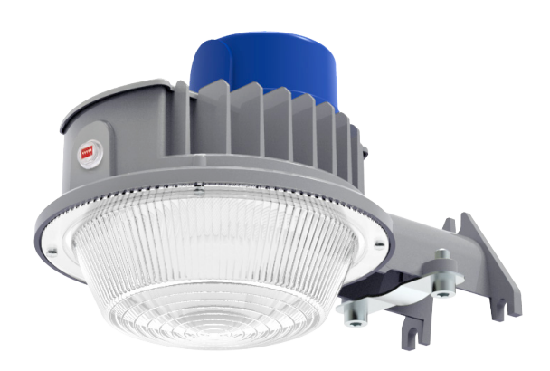
LRX-72-120W-MCTP-TL With Twist-lock photocell