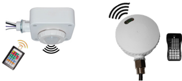
Optional Motion Sensors (Not Included) See Page A57