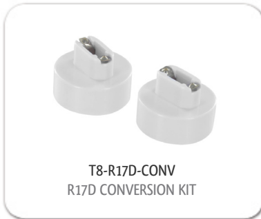
T8-R17D-CONV R17D CONVERSION KIT