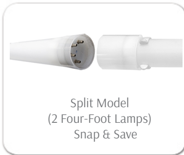
Split Model (2 Four-Foot Lamps) Snap & Save