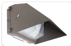
Shown with Optional Shroud See Page A27