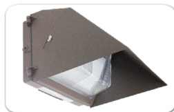
Shown with Optional Shroud See Page A27