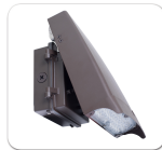
Shown with Optional Shroud See Page A27