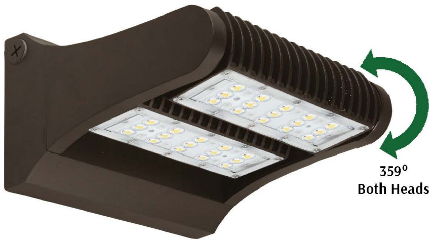
359° Both Heads