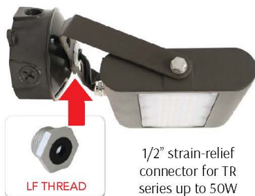
1/2" strain-relief connector for TR series up to 50W