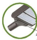
LF3-STR Street light arm (6" long to fit 2"~2-1/2" pipe)