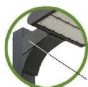
LF3-EXTARM Extension arm (4" wide to fit 4" pole)

Optional mounts - Field installed, must be ordered separately