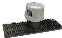
LF3-PK Photocell Kit for LF3 80W, 100W & 150W field installed