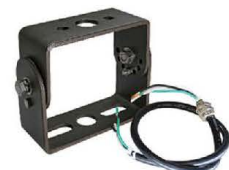
LF3-YOK Included in the box Not used when other mounting options ordered

Ordering example: LF3-220CW-480V-YK + LF3-EXTARM