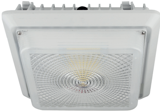
Shown with side frosted lens