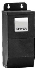
50-WATT THRU 300-WATT