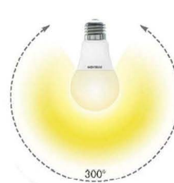
Energy Star Model