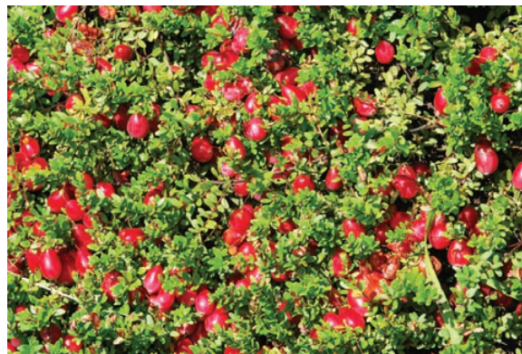
Figure 1. Vaccinium macrocarpon

uroepithelial cells by proteinaceous appendages called fimbriae. 2 E. coli adheres to uroepithelial cells via type 1 pili – long, hairy-surface organelles with a mannose-binding FimH, which is a protein component at the fimbriae end that acts as an adhesive. 18 Bacterial attachment results in a cascade of events involving elaboration of interleukin-6 and -8, which influences leukocyte infiltration. 2