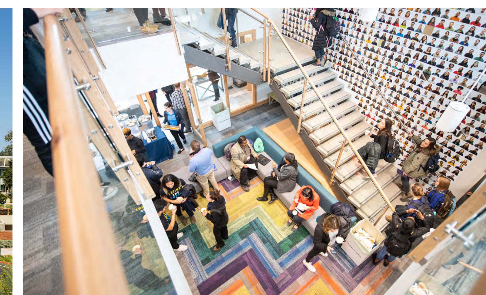
Increase space for diversity, equity, inclusion and accessibility (DEIA) opportunities across campus