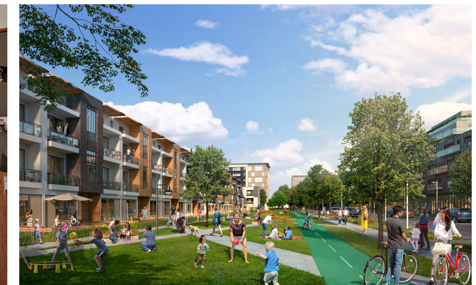
Invest in graduate, family, and workforce housing