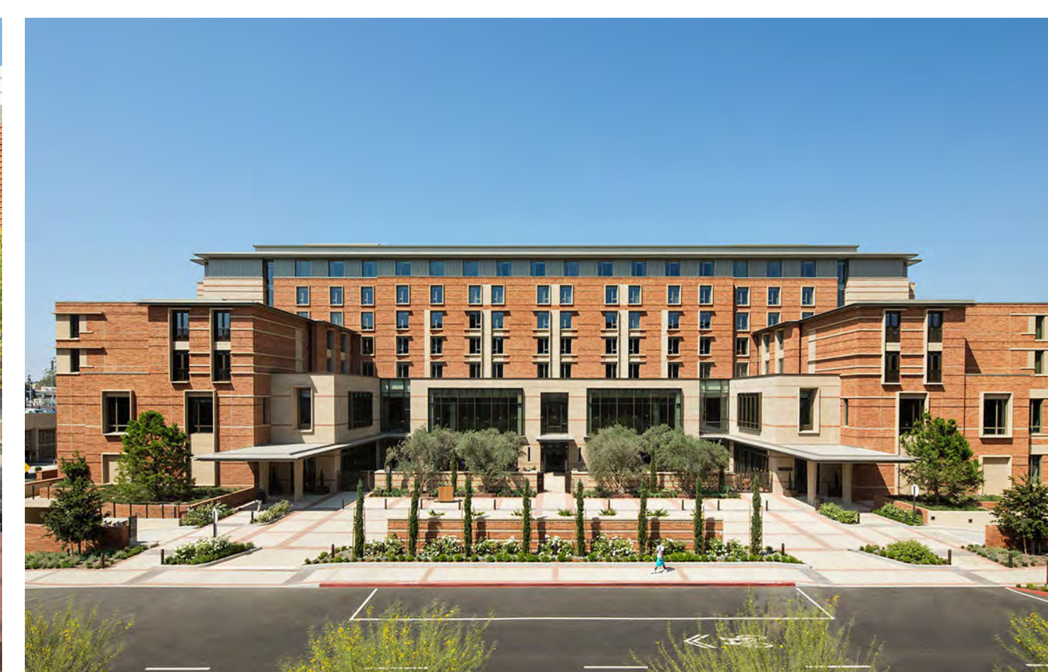
Explore opportunities for a hotel and conference center