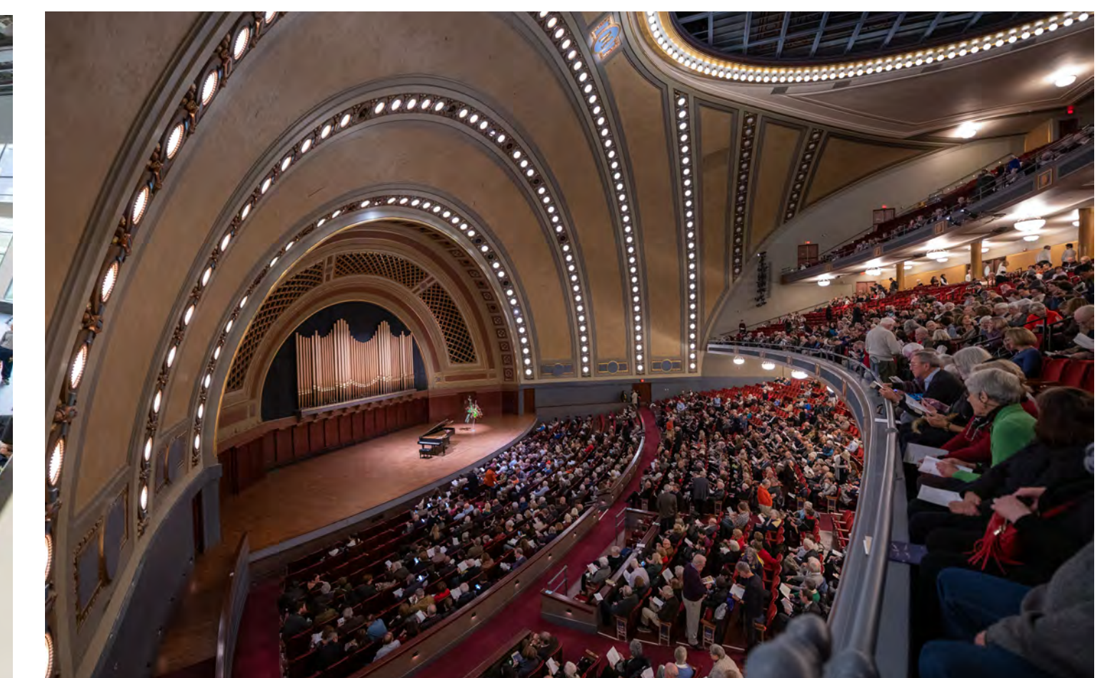
Strengthen the Arts and Humanities