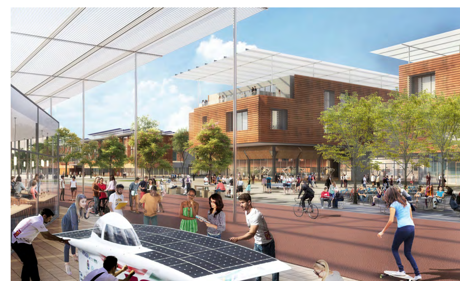
Create an Innovation District with space for research and industry partnerships and ample amenities