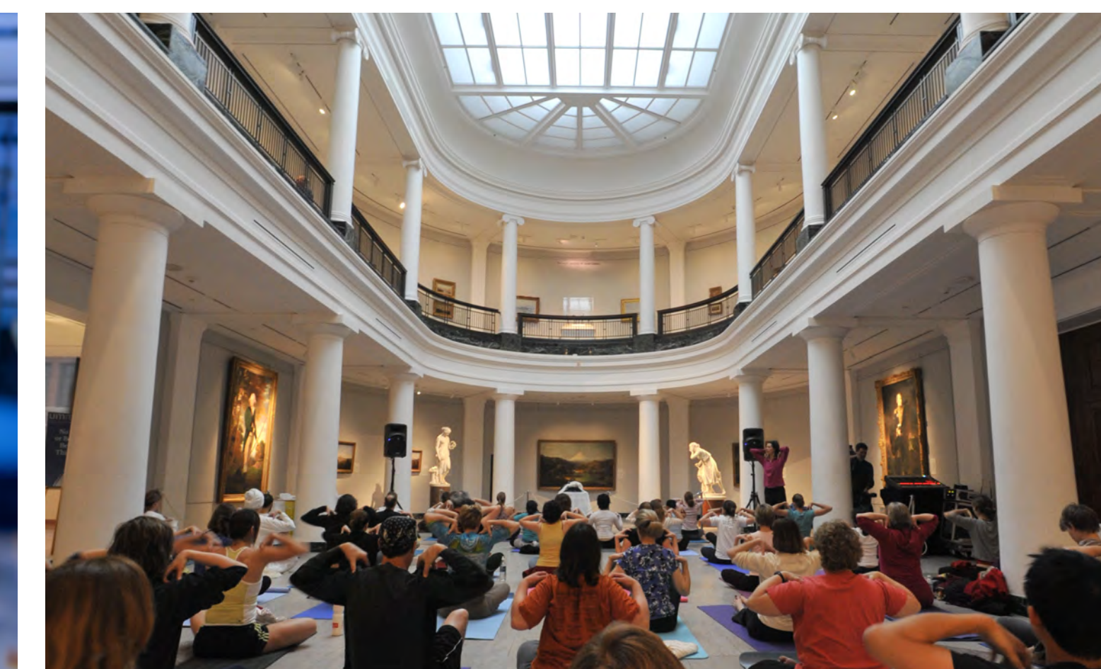
Increase access to and enhance space that promotes health and well-being