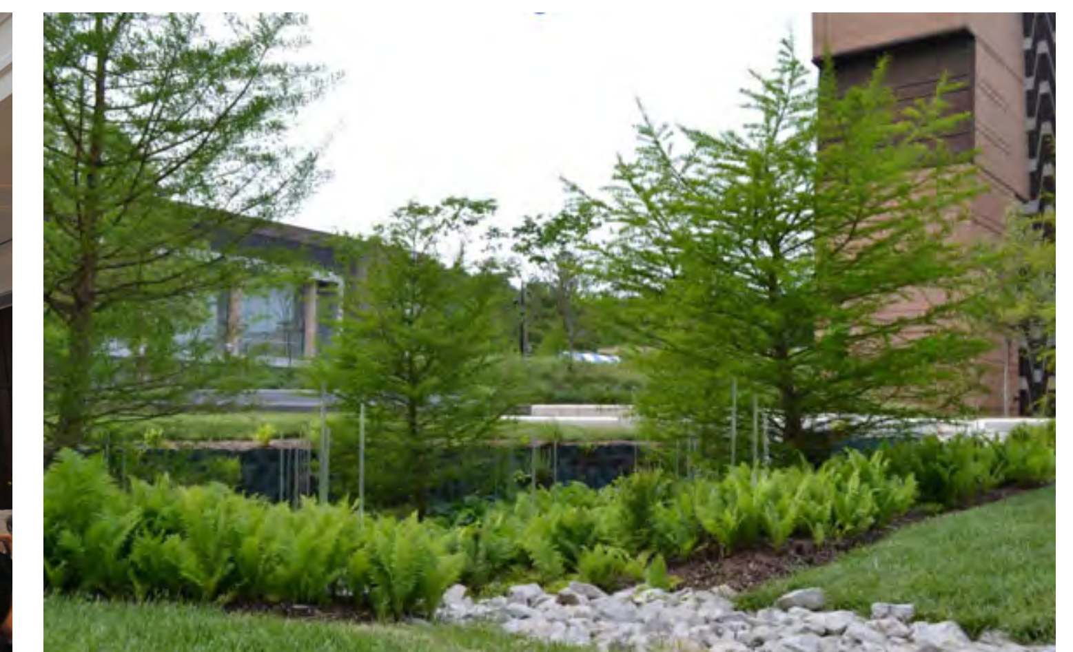
Integrate sustainability into the open space network