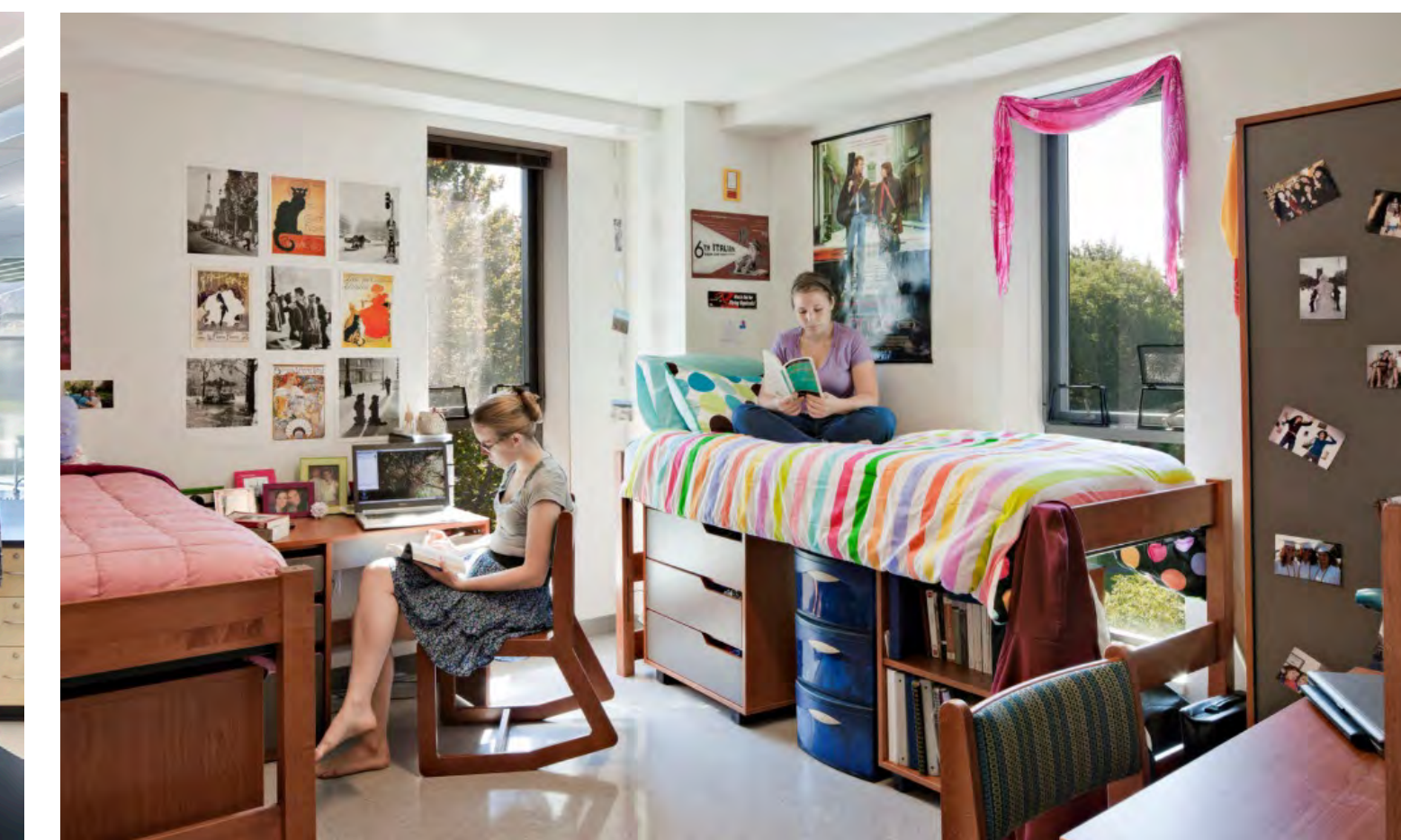
Provide new undergraduate housing experiences