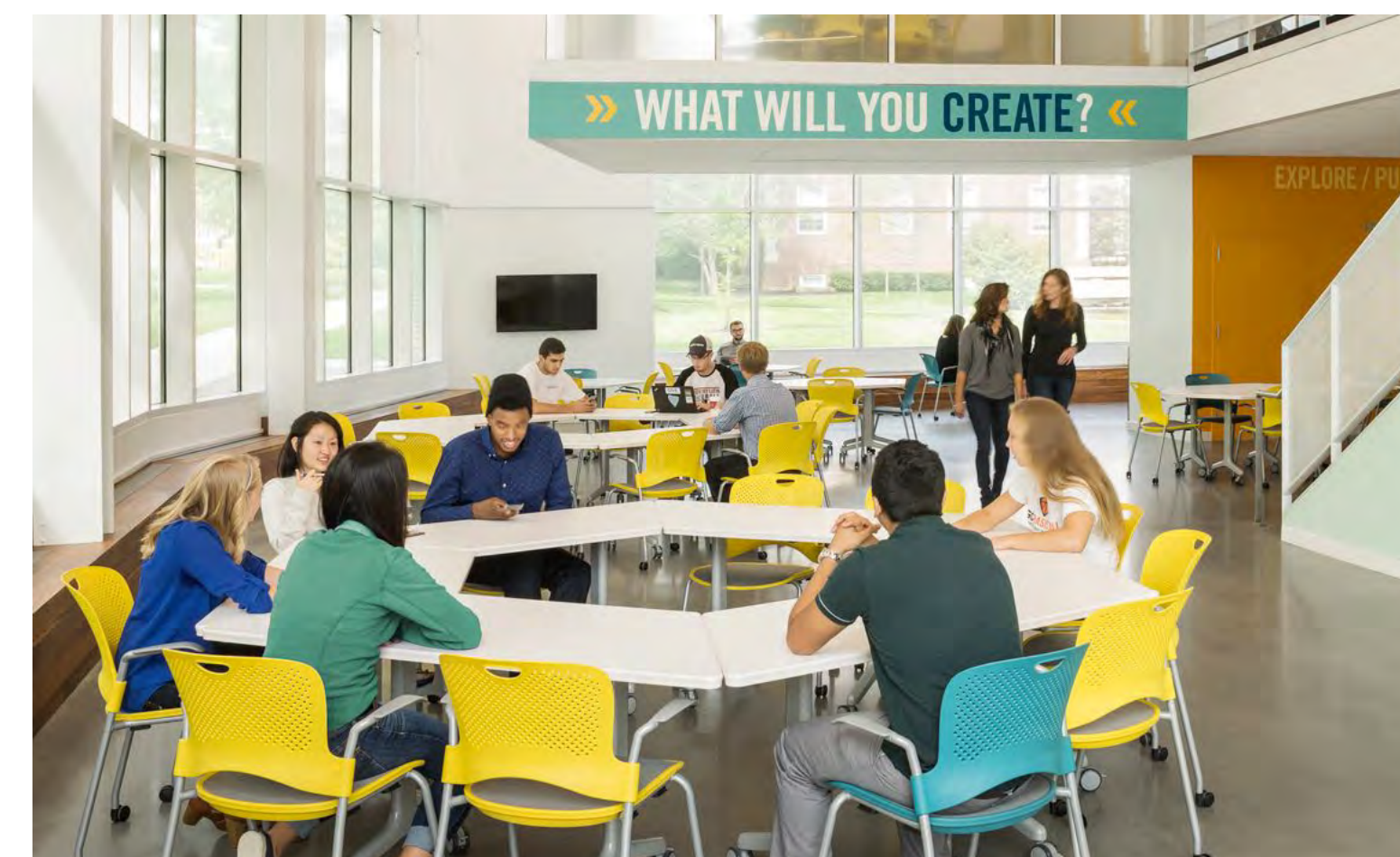
Provide collaboration spaces in renovations and new buildings