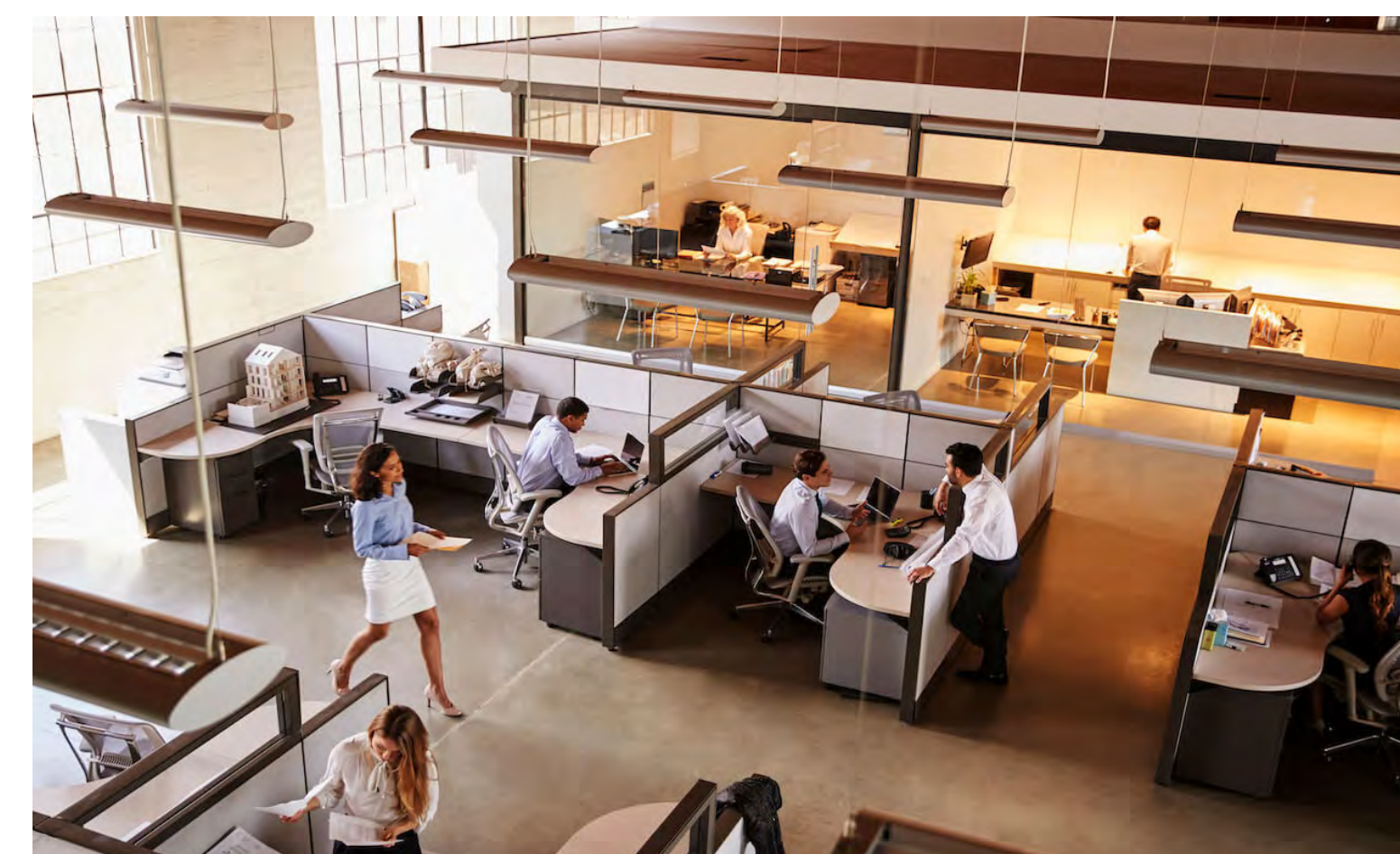
Provide new environments for hybrid work and hoteling