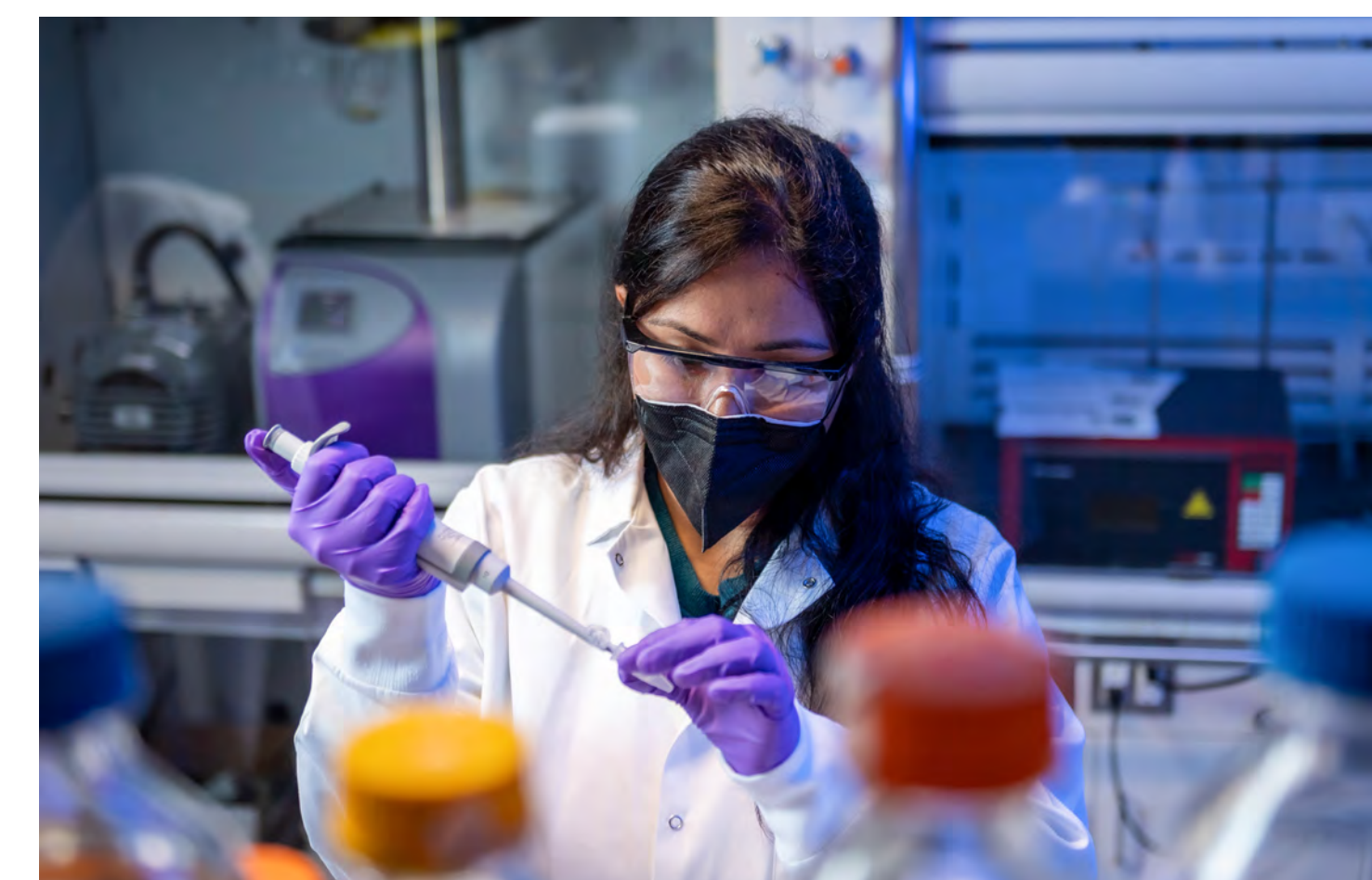
Provide space for interdisciplinary research and innovation