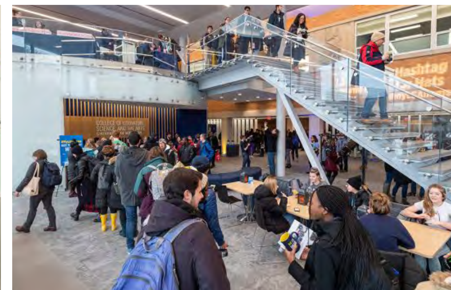
Provide places for study and social engagement