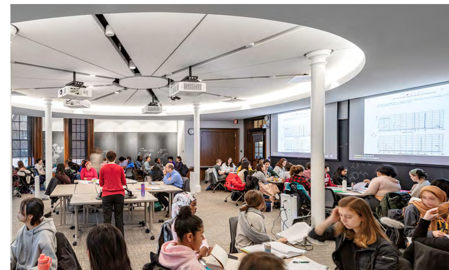
Renew classrooms and instructional space