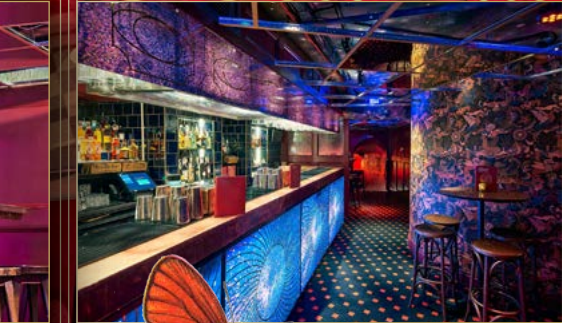
The Grand Hall: 40 Standing

Full Venue Capacity Seated 85 | Standing 220