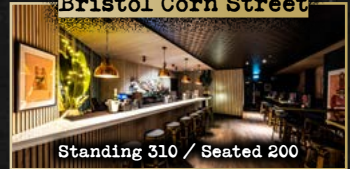
Bristol Corn Street