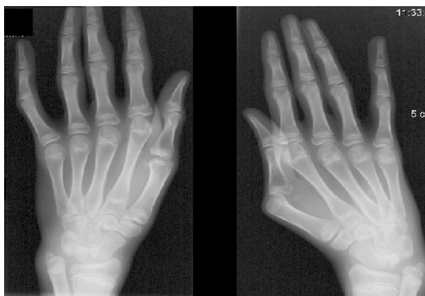
Figure 2: Anteroposterior hand radiograph showed arachnodactyly, wrist drop.

On the bases of skeletal survey; Anteroposterior hand radiograph showed arachnodactyly and wrist drop (Figure 2).