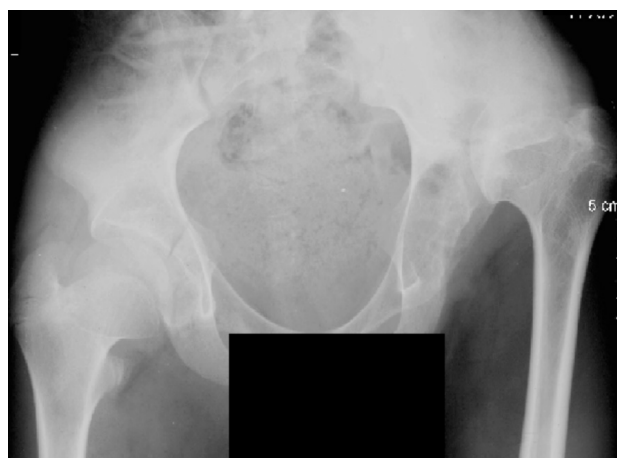
Figure 4: Anteroposterior pelvis radiograph showed drastic unilateral hip dislocation and shortened femoral necks.