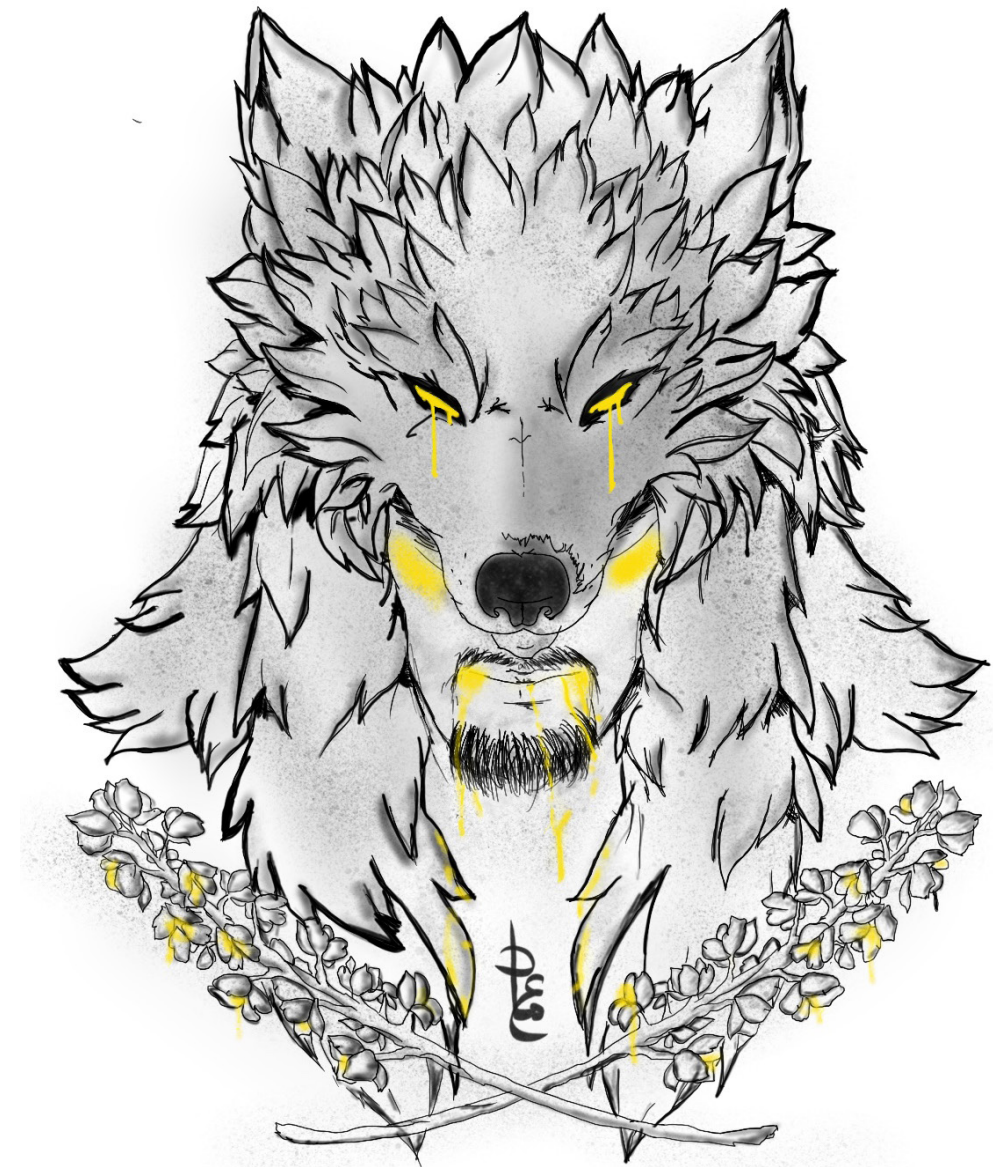
Lupus Spiritus Digital drawing Imad Guemmah