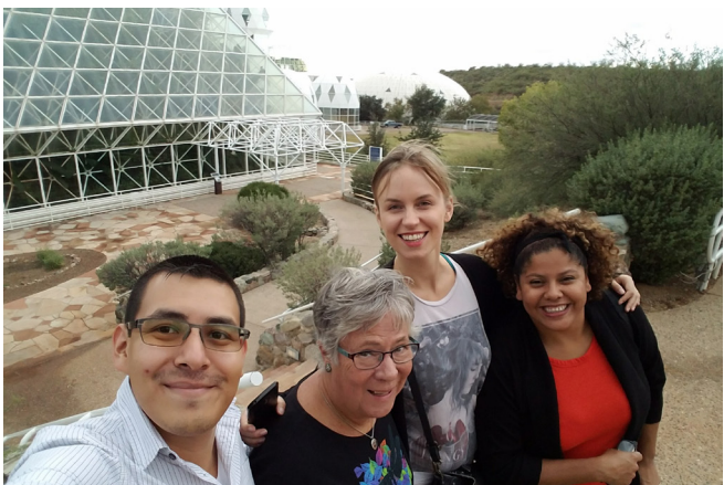
Above: Fall 2019 Picnic