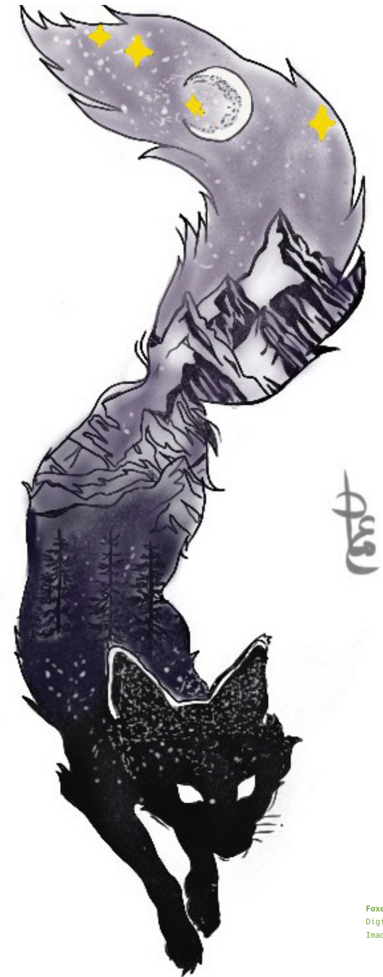
Foxes of Wondering Nights Digital drawing Imad Guemmah

Cover Photo: See article on page 4 celebrating "International Grandma", Patsy Spalding