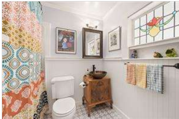
Hall bathroom has an Antique furniture-vanity, another Stained Glass window, and more charming Millwork