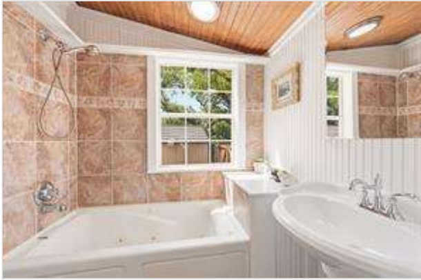
Ensuite Bath has a jetted tub, wood plank ceiling, beadboard wall paneling, and a window with more private views

2012 W Lotus Avenue, Fort Worth, Texas 76111 Listing ID: 21284204