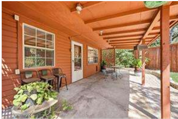
This Covered patio is off the Office-Den-Breakfast-Sunroom spaces; Impervious walkway rounds the corner to one of two front yard gates