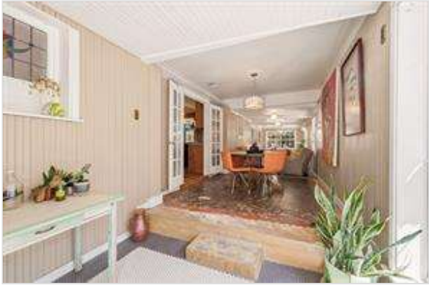
View is from a bright Sunroom with Penny tiles and Stained Glass window

2012 W Lotus Avenue, Fort Worth, Texas 76111 Listing ID: 21284204