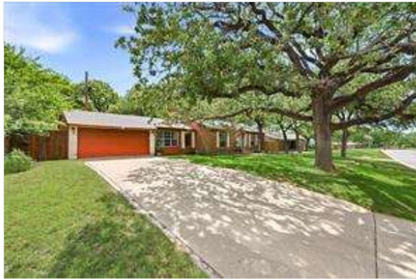
2026 Class 3 architectural composition asphalt shingle Roof on the main house (Class 4 R-panel steel in back); 2-car garage; Gates to back are on both sides of Fence