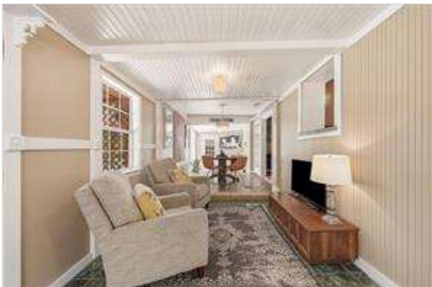
Sunlit with a beadboard ceiling, more vintage lighting encompasses this flexible area