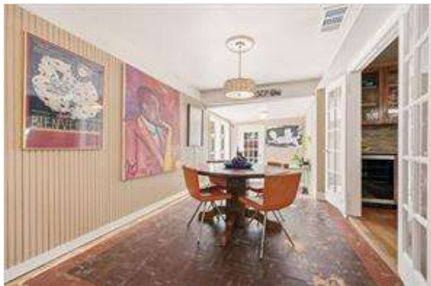
Note: ANOTHER set of French Doors off the Breakfast area