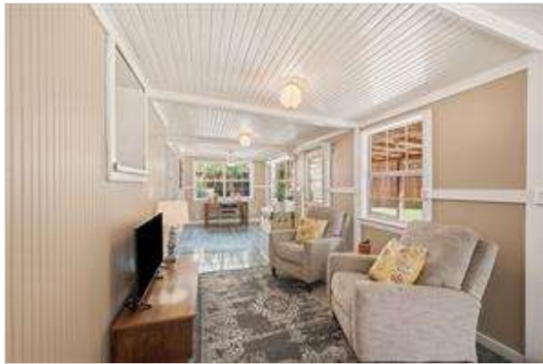
View from Breakfast room into Den then Office -- ALL PRIVATE SPACES OVERLOOKING the BACKYARD