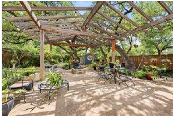
NOTE the sizable Shed in the far back corner of the yard conveys!