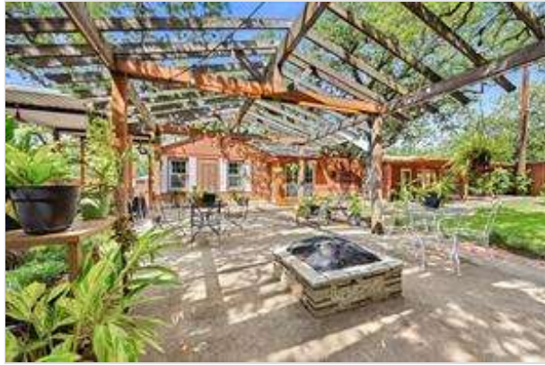
Expansive concrete patio has a wood pergola with lighting and a stone-clad fire pit