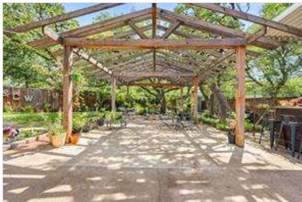
This patio is enormous...and private...and surrounded by additional mature Perennials and 6-ft privacy fence