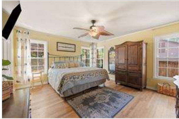
BIG bedroom with updated, modernized Ceiling Fan and backyard facing with TOTAL PRIVACY