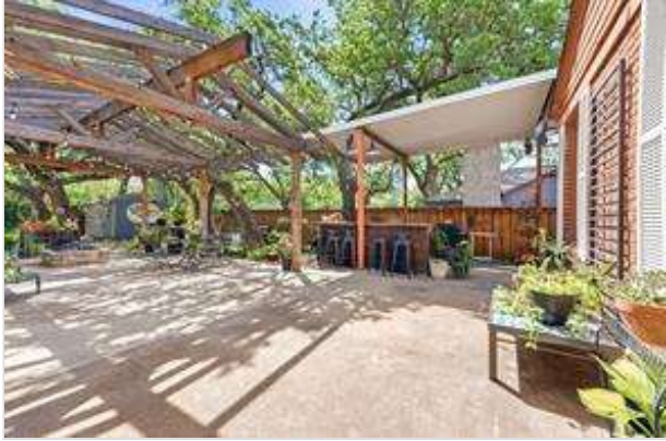
View of the Shed beyond and into the extra RV-Boat-Car parking area, currently used as another massive entertaining space

2012 W Lotus Avenue, Fort Worth, Texas 76111 Listing ID: 21284204