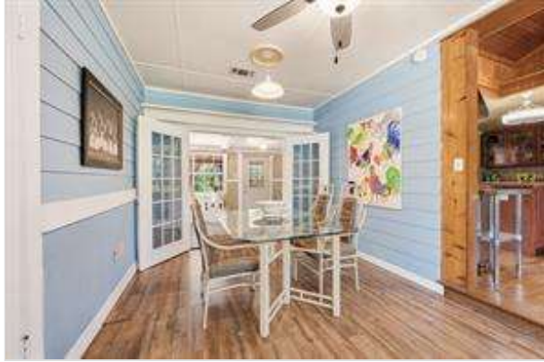
This dining space/sitting area is FLEXIBLE/ADAPTABLE -- French Doors lead to Office and Den