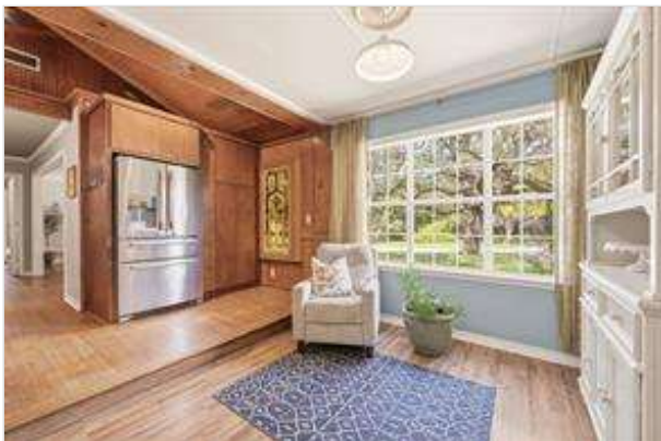
Bright sitting area outside of Kitchen is a FLEXIBLE/ADAPTABLE space; Note the ample Pantry space and Stained Glass window to the right of the Fridge