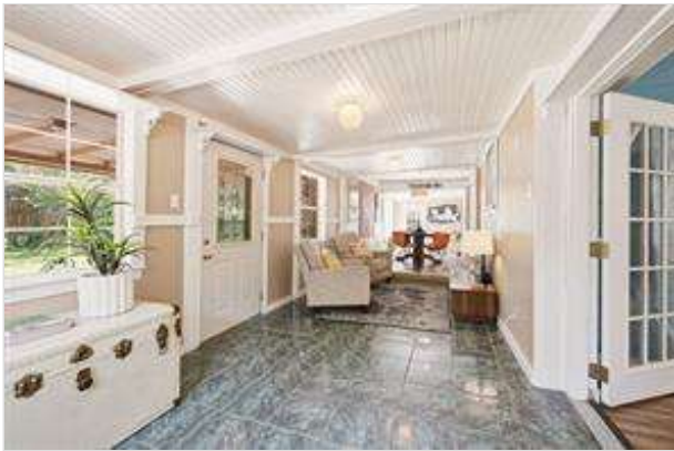
View from Office into Den, Breakfast then Sunroom -- ALL PRIVATE SPACES OVERLOOKING the BACKYARD