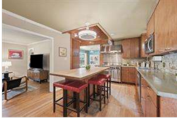
Solid-wood cabinetry; Counter-height breakfast island; Polished Concrete and Butcher Block counters