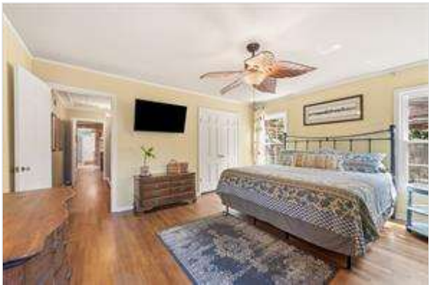
Double doors are to the walk-in closet