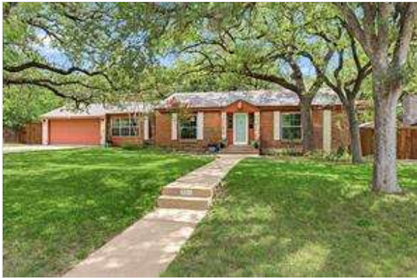
1948 Ranch-style brick home with Austin-stone accents, situated on an oversized .28-acre lot-and-a-half