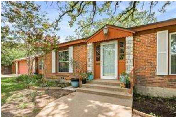
Glass screen door; Double-pane windows; Exterior Lighting; Ring Doorbell; 3-yr old tankless Water Heater; 3-yr old compressor