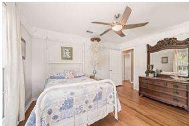
More charm with unique crown millwork; Another updated, modernized fan-light