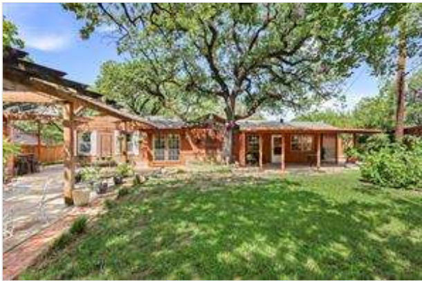
Incredibly private, expansive backyard (this is only a partial view)! Note the fully covered patio to the right