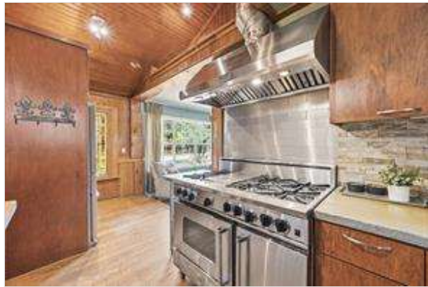
48-inch professional-grade gas convection Range with 6 burners plus grill and exterior ventilation; Vaulted beadboard ceilings