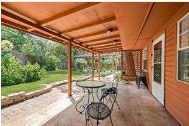
Privacy lattice panel is on each side; Mature perennial foliage is abundant