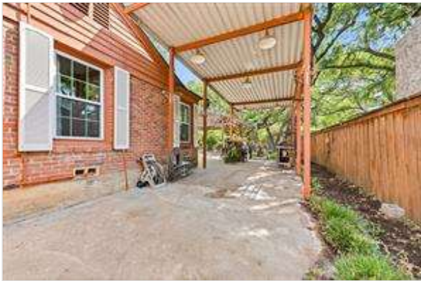
View from front of 11x56 RV, boat or extra vehicle parking area (or another covered entertainment space...or workout or hobby space); Even more Vintage lighting