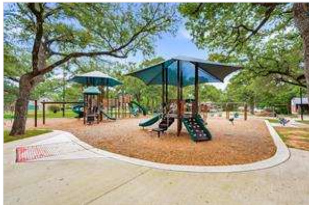
Oakhurst park features multiple play structures with slides, swings, and shade coverings, a half-basketball Court and grass aplenty -- it's the location of many neighborhood gatherings