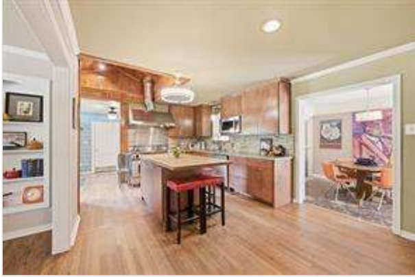
Fully renovated main Kitchen to left; Butler's station to Right (not shown in this photo); Ceiling light is also a fan