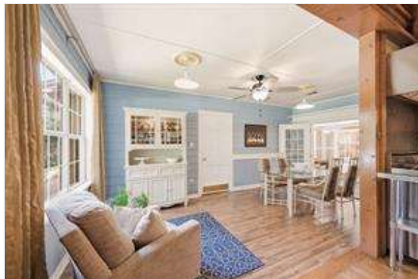
Solid door in photo leads to the Garage