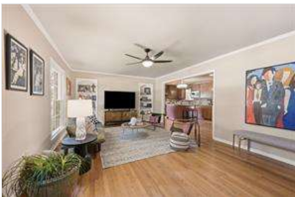
Open Floor Plan - note the Kitchen just beyond