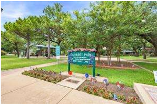
Oakhurst Park is a quick jaunt away within this most picturesque neighborhood