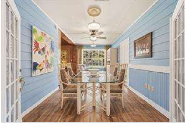
Shiplap walls with beadboard wainscoting; Vintage period Lighting; Updated ceiling fan-light; Massive window with views of mature trees

2012 W Lotus Avenue, Fort Worth, Texas 76111 Listing ID: 21284204