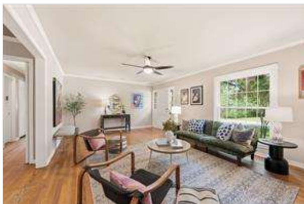
Updated, modernized Ceiling fan-light; Crown Molding; Hallway at photo-left leads to Beds-Baths