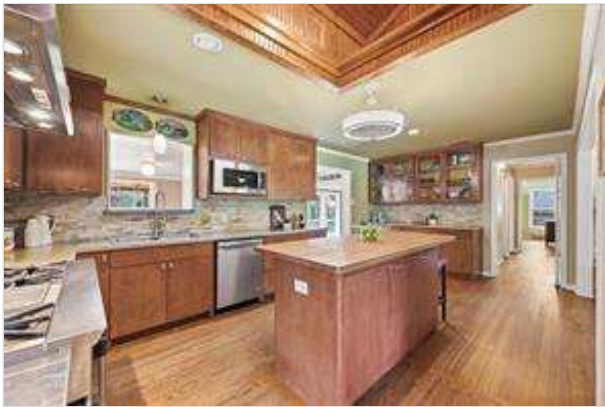
Stainless Steel appliances; Ledgestone Backsplash; NOTE the Butler's station with beverage fridge to Right