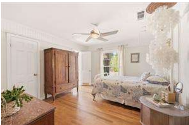
Another BIG bedroom; Door to Left is Walk-in closet; Door to Right is ensuite Bathroom