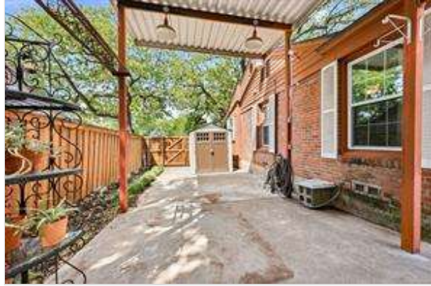
Rubbermaid Shed conveys; Note the double entry gates that lead to the front yard which can easily be widened for RV, Boat or car storage