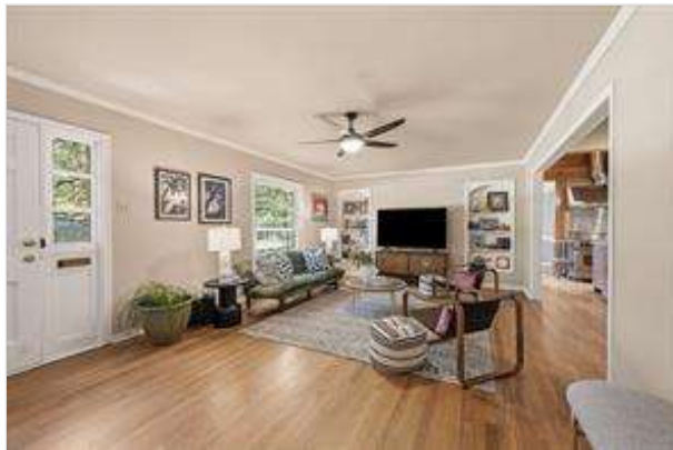
Sidelights at Front Door; Large Foyer; Original Wood Floors; Original built-in shelving