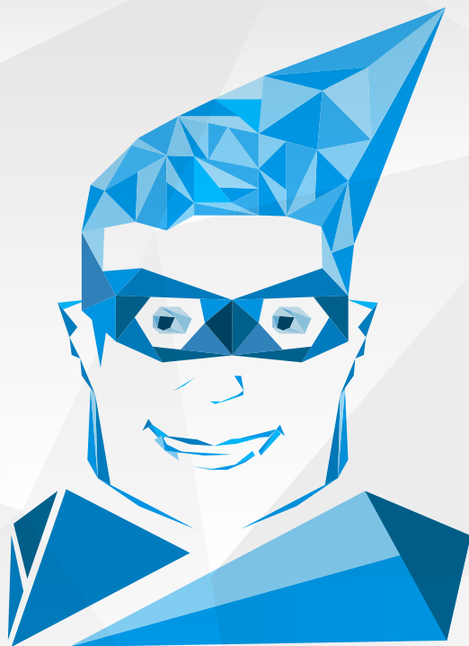
crypto unicorn Surfman