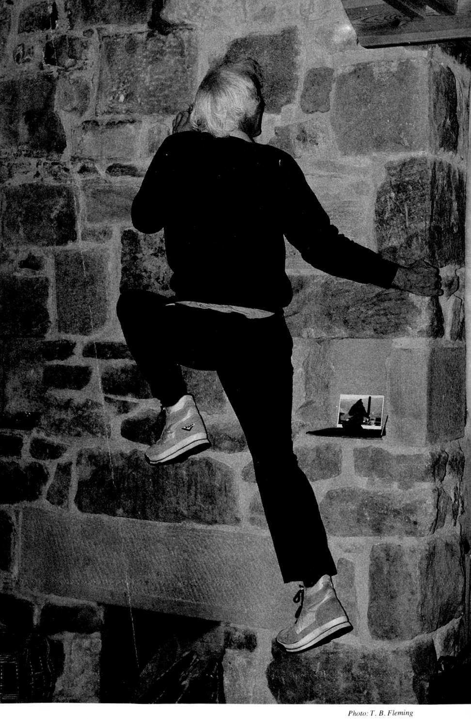
The President on the final headwall