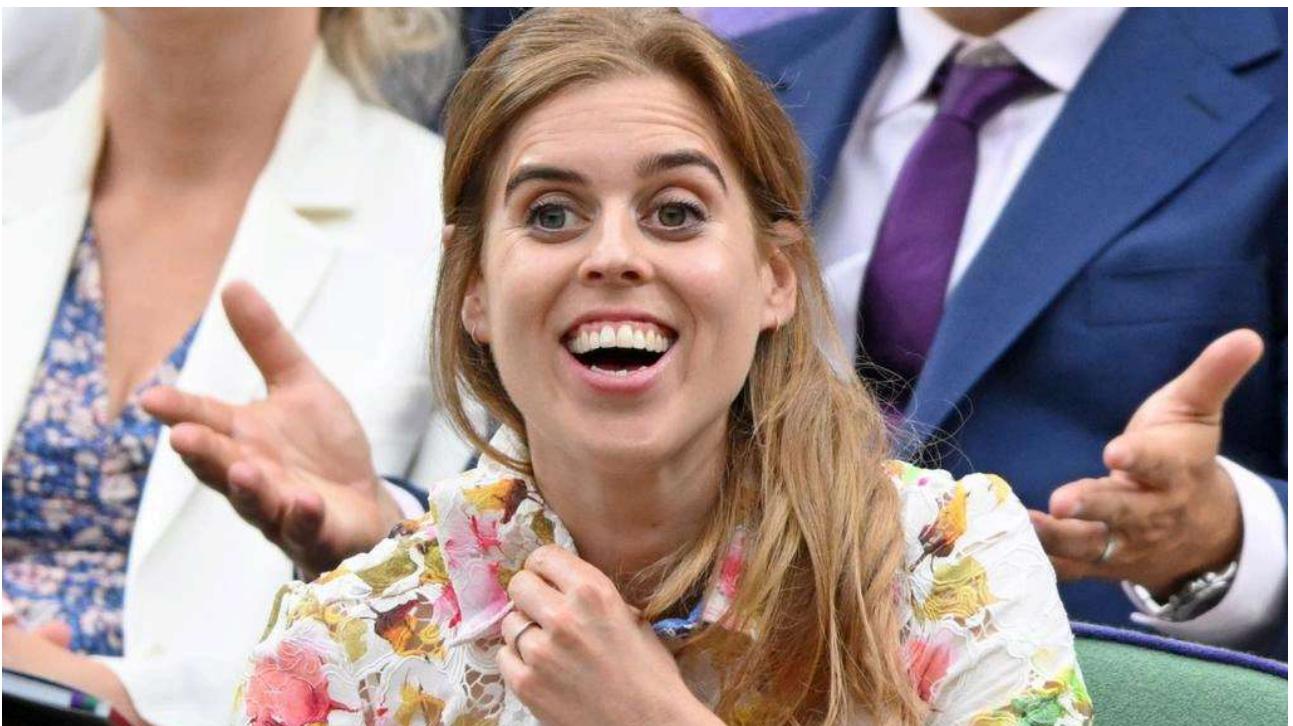
Beatrice was spotted cheering on Italy's Jannik Sinner at Wimbledon last week.

The source noted Beatrice’s personal protection officer, known as a PPO, will not be reinstated on a full-time basis and will only be required for "public events".