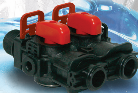
Includes bypass valve