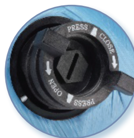
Dome hole fill port