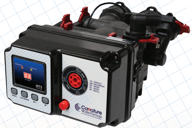
MTS 95 Series Valve