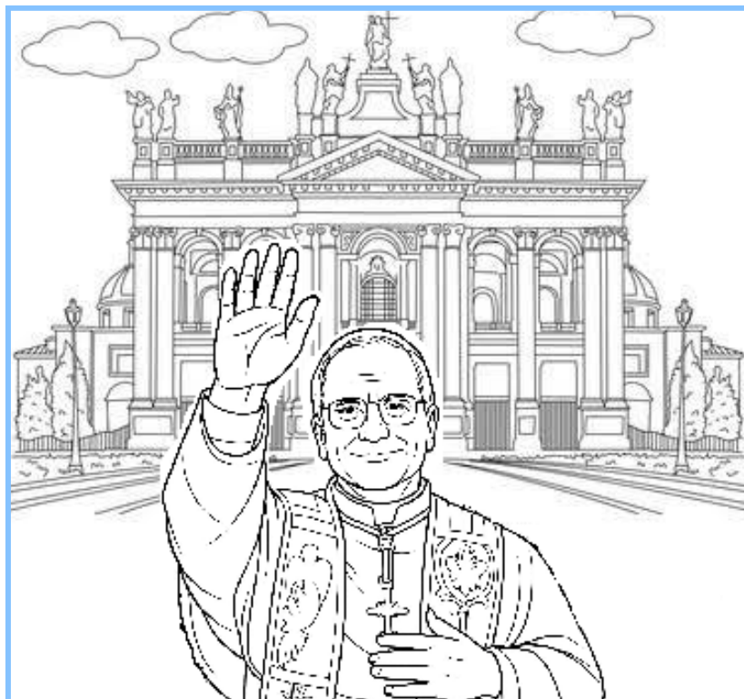
DEDICATION OF ST. JOHN LATERAN

La Basílica de Letrán (oficialmente: la Archibasílica de San Juan de Letrán) es la catedral oficial del Papa, y tiene el título de "Madre y Cabeza de todas las Iglesias".